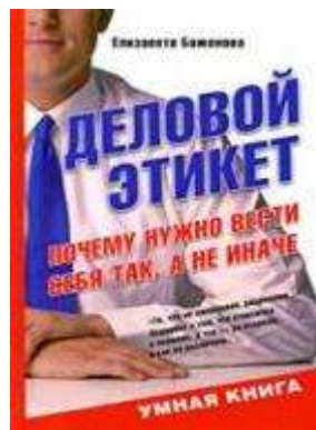
Деловой этикет. Почему ...